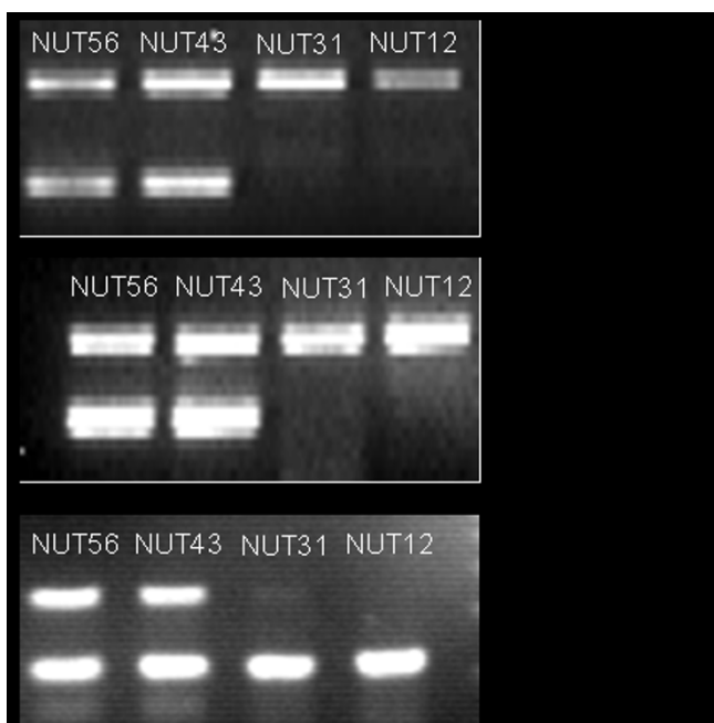
Figure 3 Verification of gene expressions by semi-quantitative RT-PCR. The RT-PCR analysis confirmed down-regulated expression of the identified genes in the endometrial tumors. The mRNA expressions of Gpx3 , Bgn and Tgfb3 are shown here. NUT56 and NUT43 are specimens from normal/pre-malignant endometrium, whereas NUT31 and NUT12 are EAC specimens.

tification of new diagnostic markers and potential therapeutic targets.